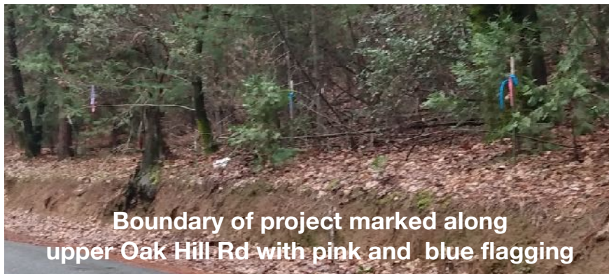
Boundary of project marked along upper Oak Hill Rd with pink and blue flagging

If you have property along these selected, main road segments and have been contacted in the past about providing a Right of Entry agreement but have delayed, please send yours in or contact Lester Lubetkin to discuss your ideas or concerns info@oakhillfiresafe.org